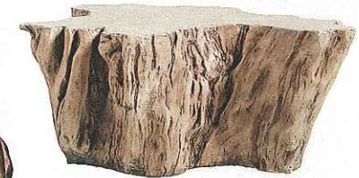
Root outdoor coffee table ($1,499), arhaus.com