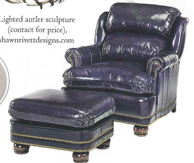
Austin chair and ottoman (chair, $4,725; ottoman, $1,680), hancockandmoore.com