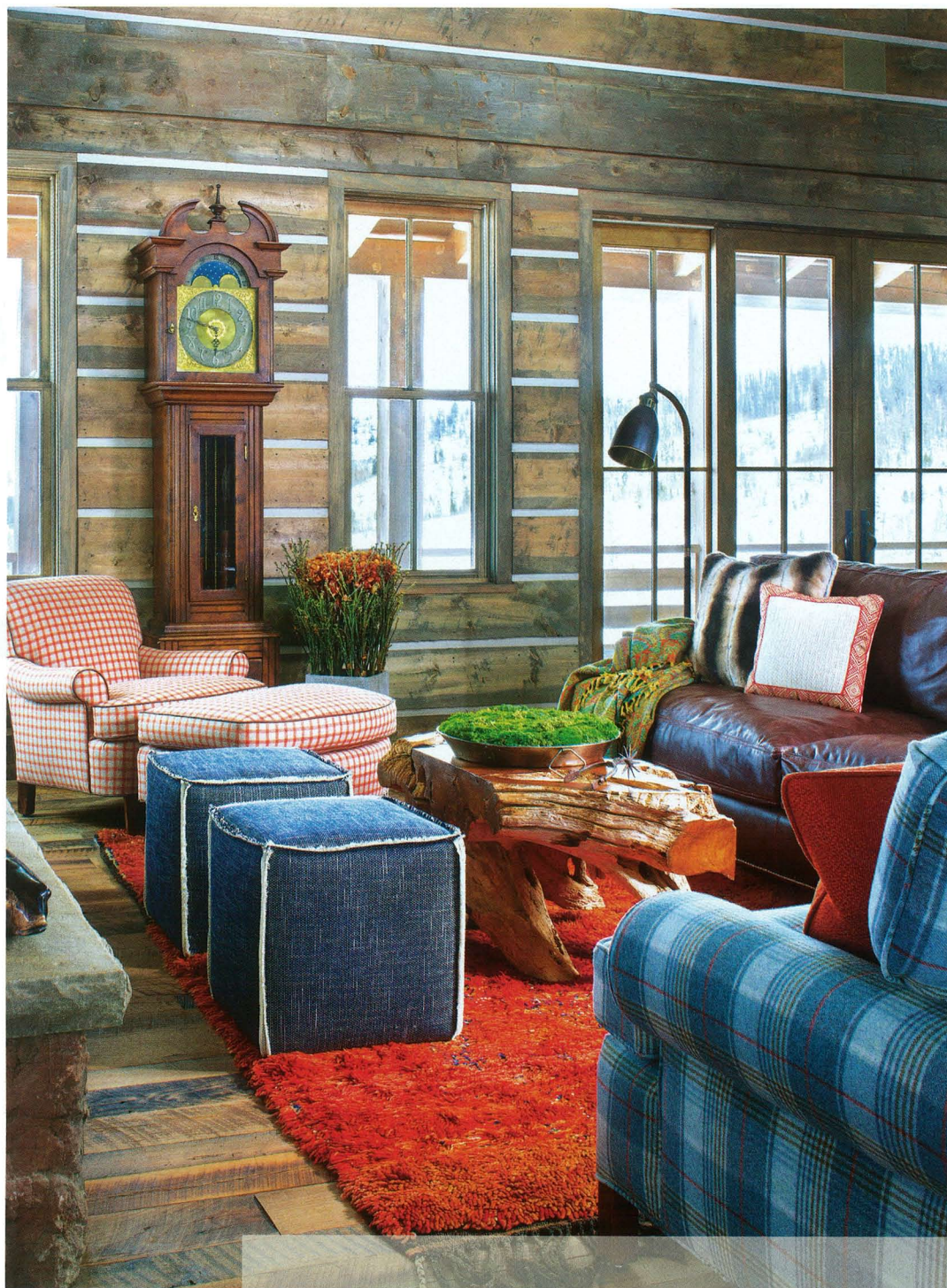
ABOVE: For the inviting living area, Kaufman had custom ottomans made from raw-edged linen that resembles denim; the Atlantis coffee table by Groovystuff is crafted from a petrified tree root. The Moroccan rug is from Artisan Rug Gallery, and the grandfather clock is a family heirloom. RIGHT: The kitchen features custom cabinetry from New Mountain Design, a vintage porcelain sink and an oversized work island. The Manuscript pendant lights overhead are by Currey & Company, and the bar stools are from Restoration Hardware.